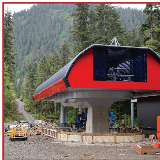
Mountain Top Gondola Construction