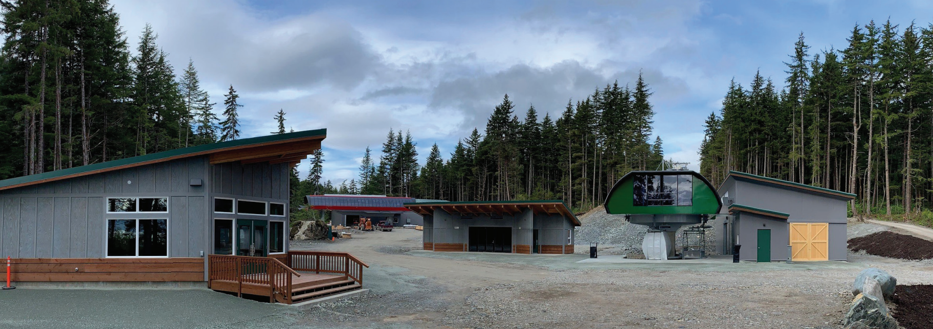
New Wilderness Landing Site Construction