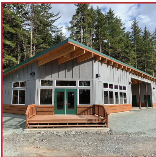
Wilderness Landing Gift Shop