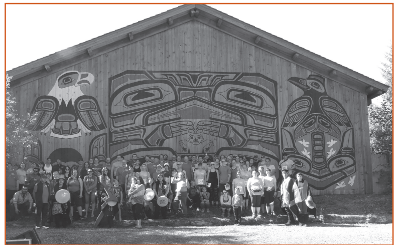
Jeet's Challenge Runners in front of the Tribal Dance and Cultural Legends Theater.